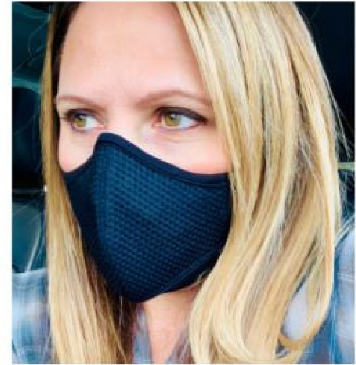
HALO Mask offers various styles & materials. For a full catalog contact your HALO Mask representative.